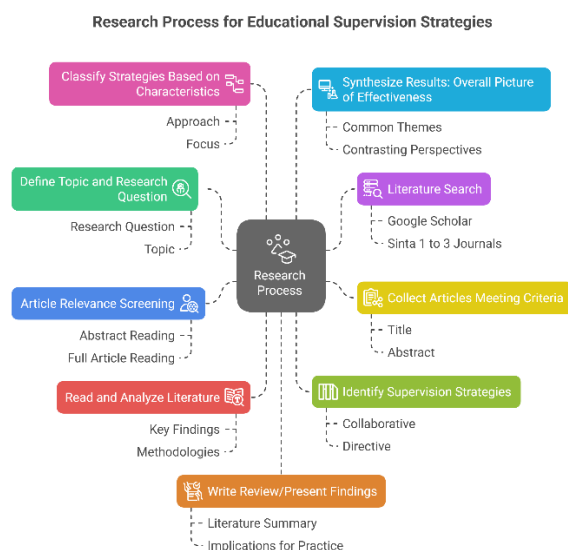
Figure 1. Research Process

This research uses the literature study method to analyse effective educational supervision strategies in improving teacher professionalism. The research process began with determining the topic and research questions, namely: What are the effective educational supervision strategies in improving teacher professionalism? Second, the search for relevant literature. Third, collecting, reading and analysing the literature. Fourth, writing a review or presenting the findings. Literature was obtained from academic databases through Google Scholar indexed by Sinta 1 to 3 based on articles relevant to the topic of educational supervision and teacher professionalism published in 2019 to 2024 using the keywords supervision, teacher, professionalism. Articles that met the criteria were collected and analysed using a descriptive approach. Irrelevant articles were excluded from the analysis. The analysis was conducted by identifying supervision strategies, classifying the findings based on the characteristics of the strategies, and synthesising the results to provide an overall picture of the effectiveness of supervision strategies in improving teacher professionalism. The research process can be seen in Figure 1 below.